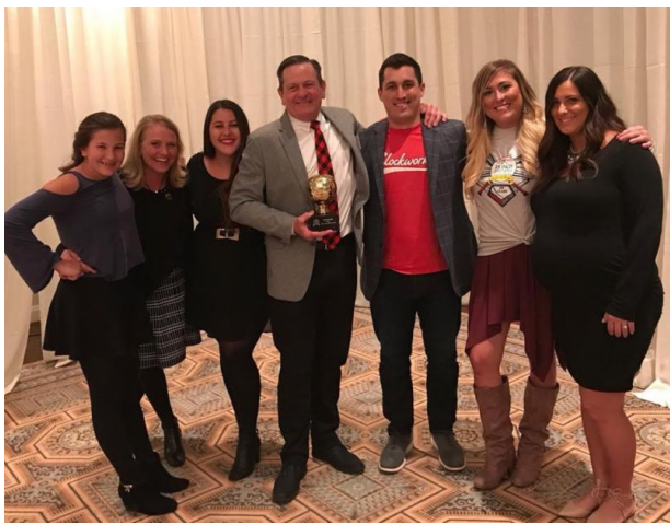
The Duff Family