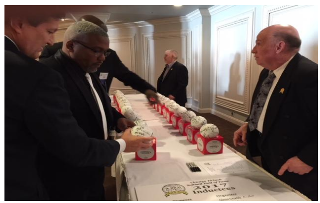
HOF Inductees singing in on Clinchers