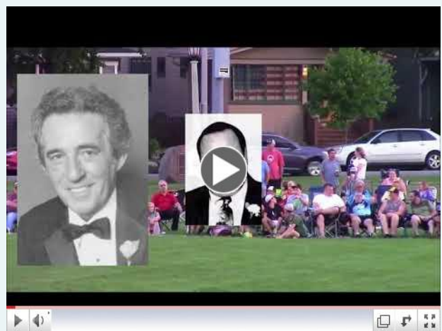
HOF Inductee Opening Video- Honoring Forest Park

8pm: Play-in games to celebrate 50th Anniversary of Forest Park