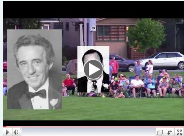
HOF Inductee Opening Video- Honoring Forest Park

Enjoy the short opening video below that was shown at the inductee dinner celebrating Forest Park's 50th Anniversary of the no glove nationals.